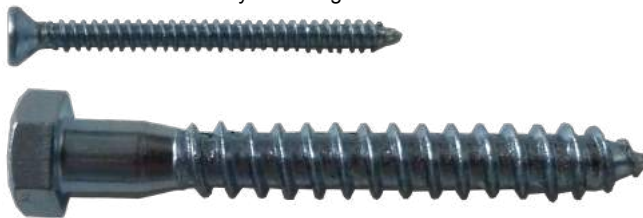
Atlas American Standard Mounting Hardware: 3/8” 3” Lag Screw